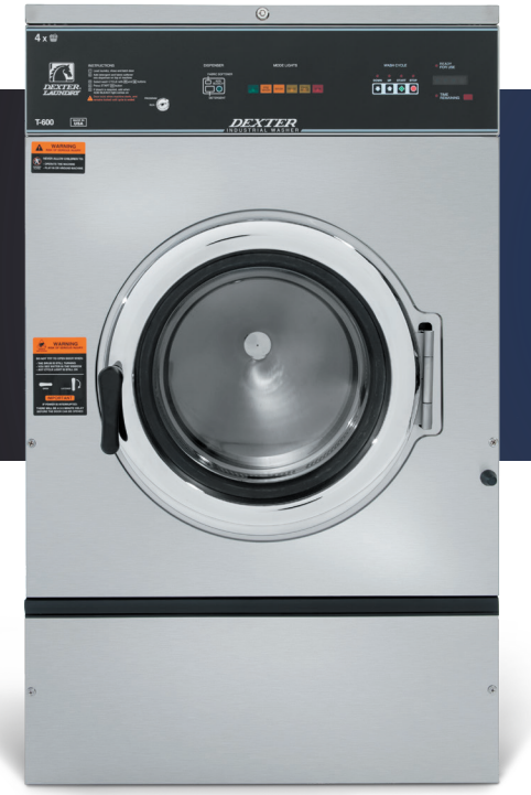
6 Cycle Control