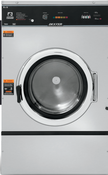
6 Cycle Control