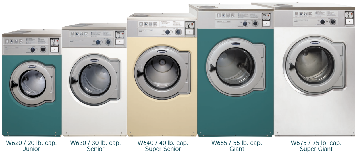
W620 / 20 lb. cap. Junior

Designed and built for the 21st Century!